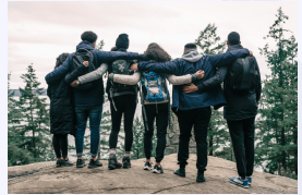
Illustration of Sample Input 1.