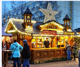
Mulled wine stall at the Leipzig Christmas Market.